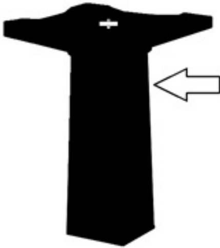
FT-107B (120 lbs) 18"L x 18"W x 25.5"H

Assemble your fountain on a level surface capable of holding a minimum of 134 pounds with an approximate 6 square inch footprint.