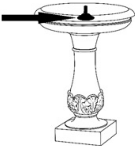
FT-141A (5 lbs) 5.5" W x 2.75" H