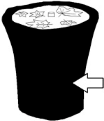
FT-258B (79 lbs) 18"L x 16.5"W x 18"H

Assemble your fountain on a level surface capable of holding a minimum of 110 pounds with an approximate 0.75 square foot footprint.