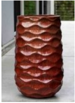
6822-7101 Sunset Red