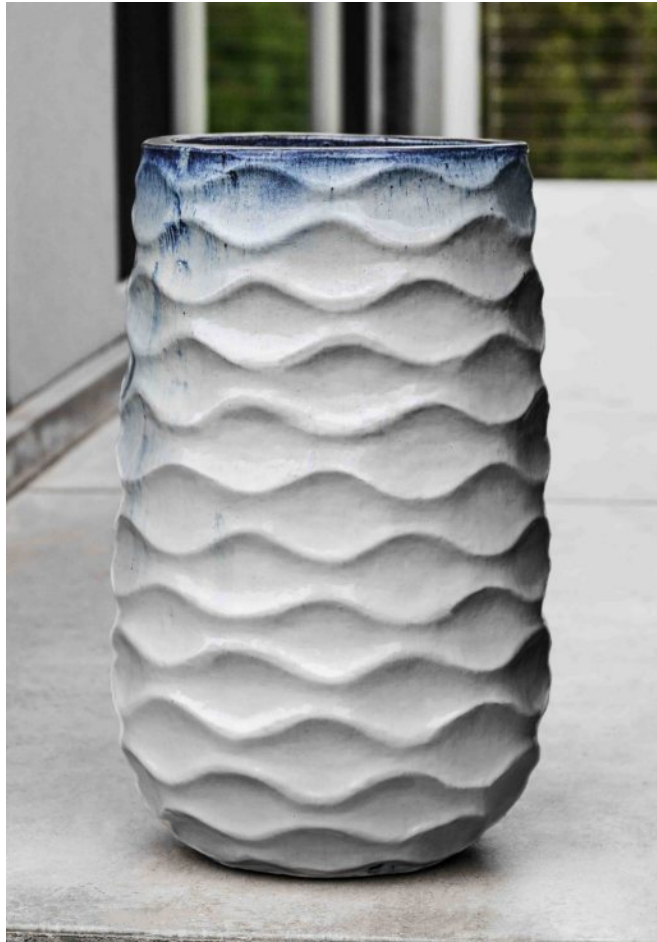
TALL RUMBA PLANTER MILK