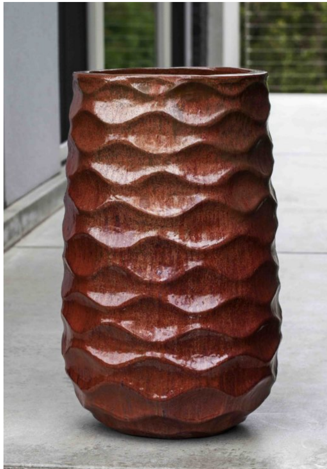
TALL RUMBA PLANTER SUNSET RED