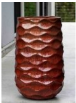
6822-7101 Sunset Red