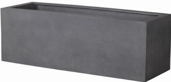
Lead Lite (34)