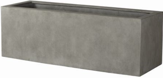
Concrete Lite (88)