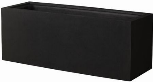
Onyx Black Lite (139)