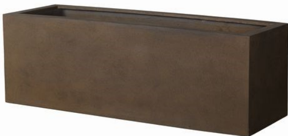
Rust Lite (18)

Actual colors may vary slightly from those depicted in these examples. Color samples are available. Call 215-541-4330 for more information