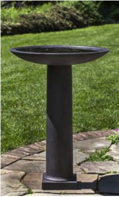
Shown in (TN)