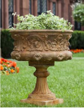
Shown in: Ferro Rustico (FR)