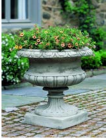
Shown in: Greystone (GS)