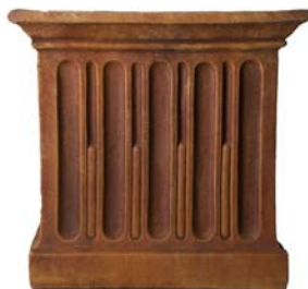
Ferro Rustico (FR)*