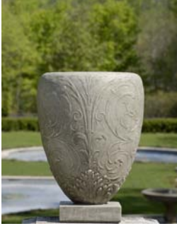
Shown in: Greystone (GS)