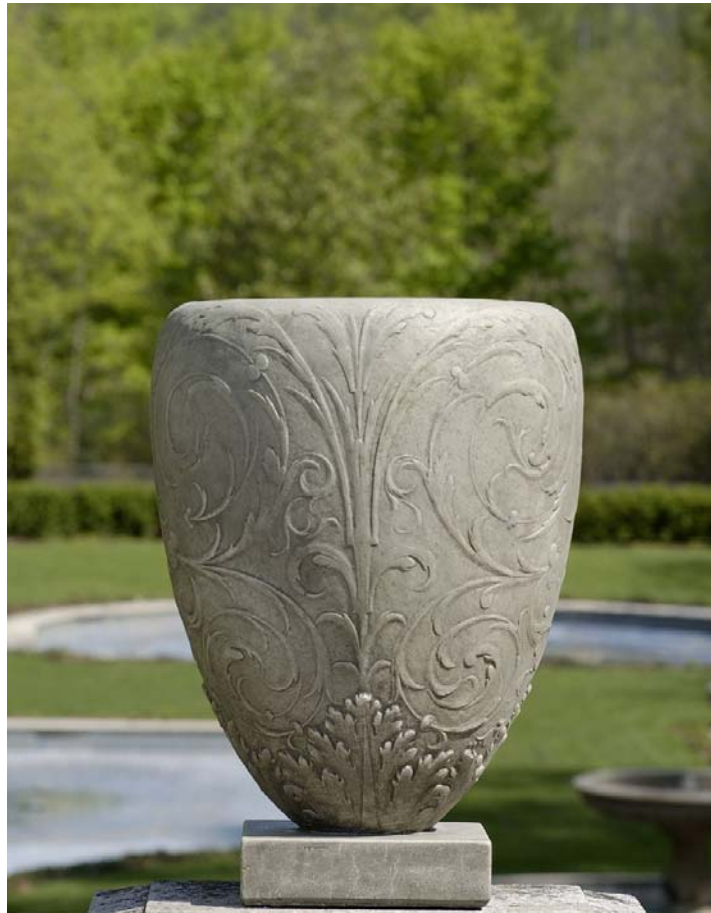
LONGWOOD ARABESQUE URN