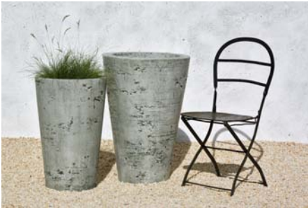
Shown in: Alpine Stone (AS)