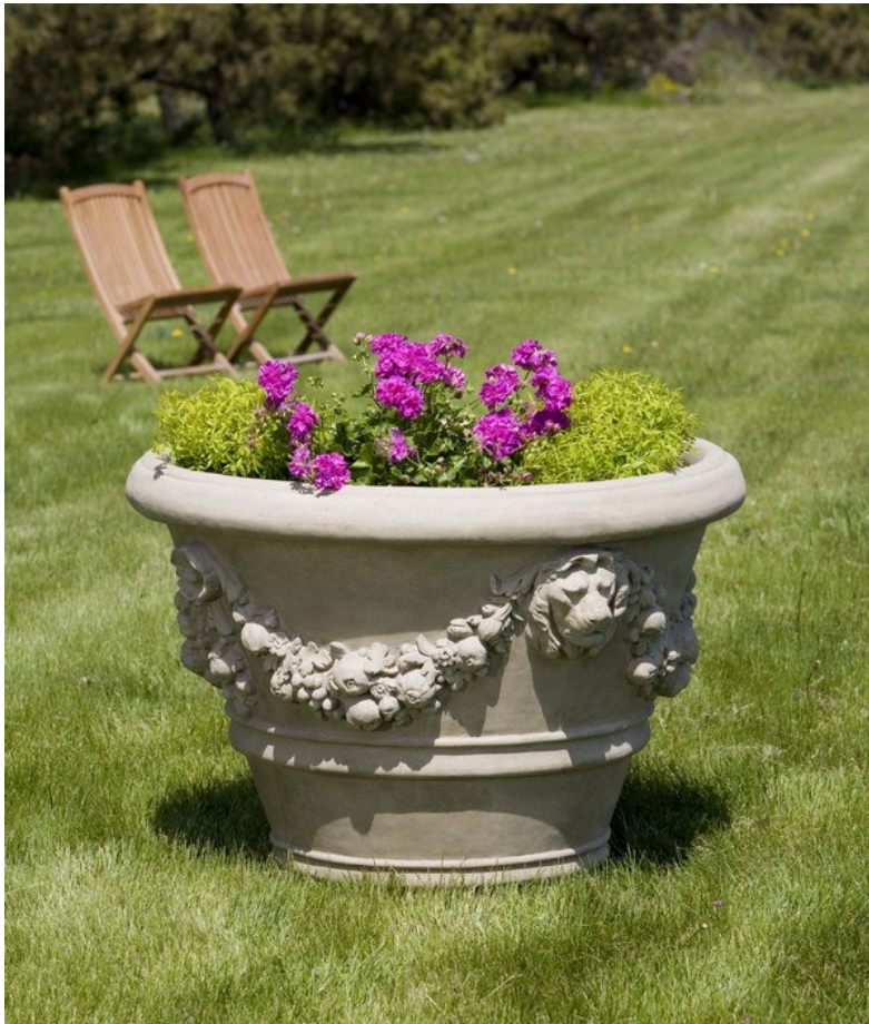
MORRIS LION POT