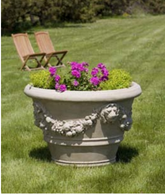
Shown in: Verde (VE)