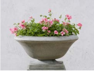
Shown in: Alpine Stone (AS)