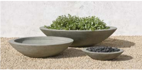
Shown in: Alpine Stone (AS)