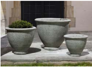
Shown in: Alpine Stone (AS)