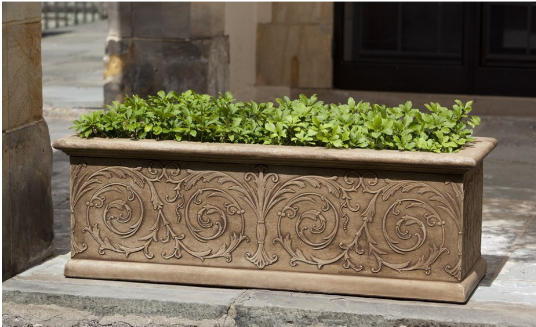
ARABESQUE WINDOW BOX