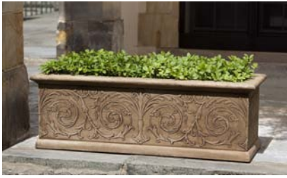
Shown in: Aged Limestone (AL)