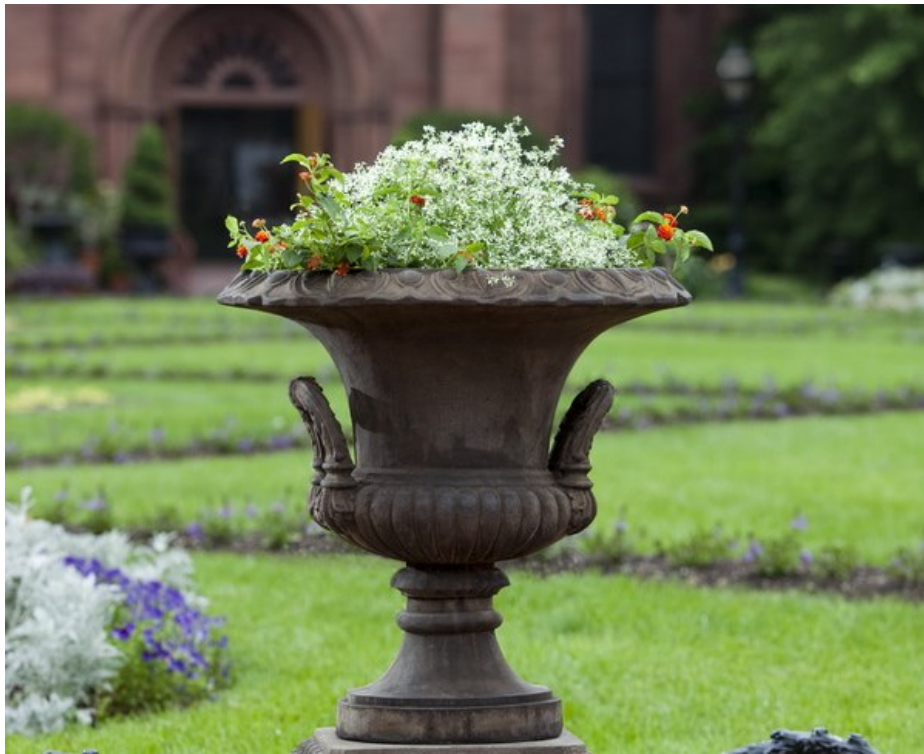
SMITHSONIAN L'ENFANT URN