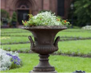
Shown in: Terra Nera (TN)