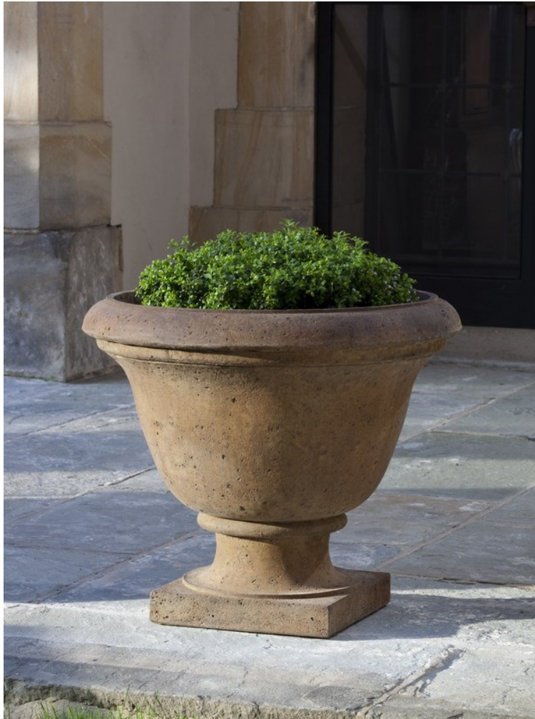
RUSTIC GREENWICH URN