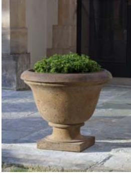
Shown in: Pietra Vecchia (PV)