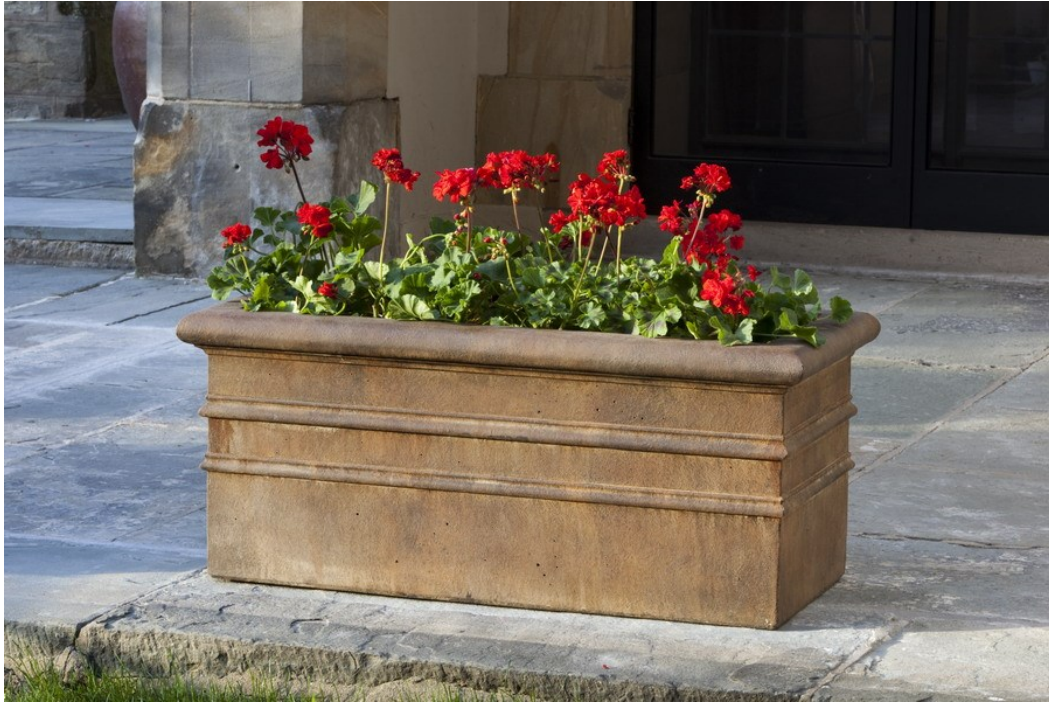
CLASSIC ROLLED RIM WINDOW BOX