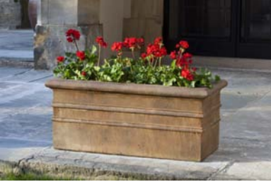
Shown in: Pietra Vecchia (PV)