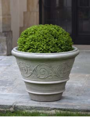
Shown in: Alpine Stone (AS)