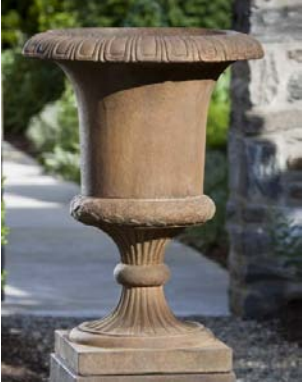
Shown in: Pietra Vecchia (PV)