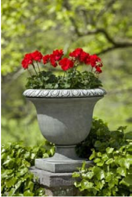
Shown in: Alpine Stone (AS)