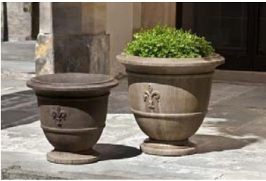
Shown in: Left: Pietra Vecchia (PV) Right: Aged Limestone (AL)