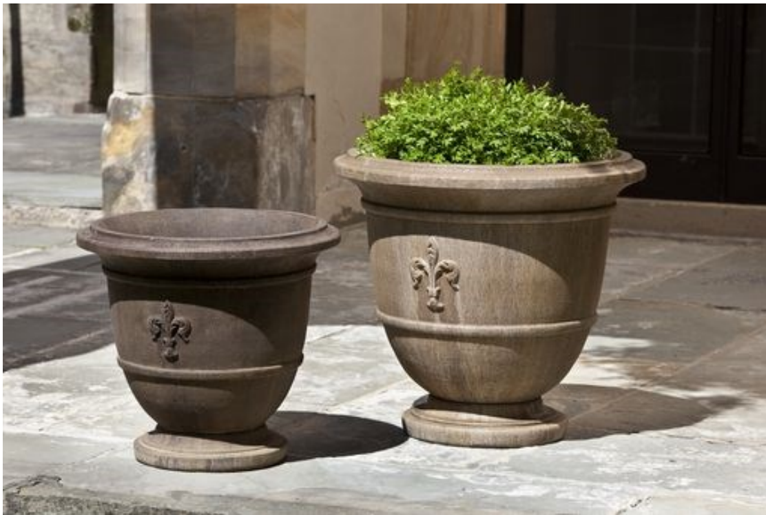
FLEUR DE LIS URN