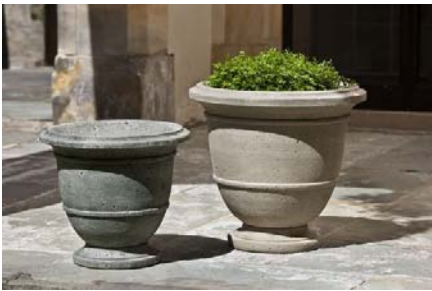
Shown in: Left: Alpine Stone (AS) Right: Verde (VE)