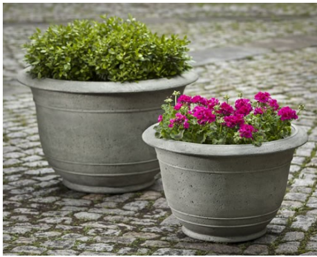
Shown in: Alpine Stone (AS)