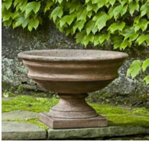
Shown in: Pietra Vecchia (PV)