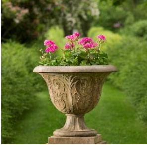
Shown in: Aged Limestone (AL)