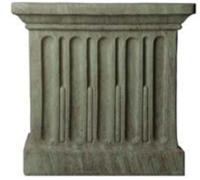
Copper Bronze (CB)