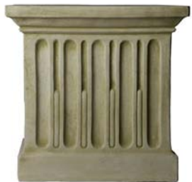
English Moss (EM)