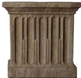
Aged Limestone (AL)