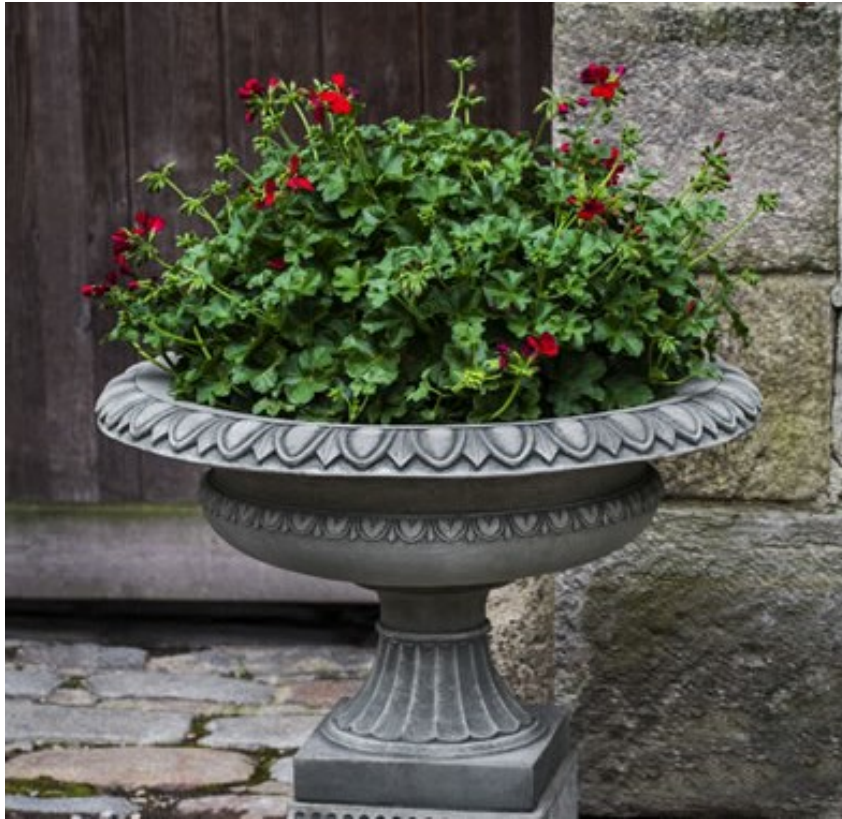
BEACON HILL URN