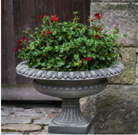
Shown in: Alpine Stone (AS)