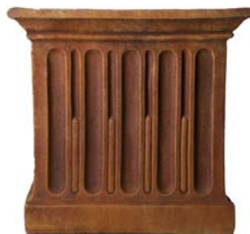
Ferro Rustico (FR)*