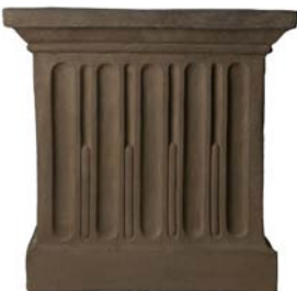
Pietra Vecchia (PV)*