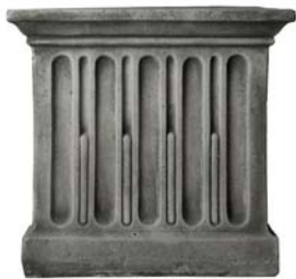
Alpine Stone (AS)

Due to the hand-application process and photography, actual colors may vary slightly from those depicted in these examples. Please consult our catalog photos and our website for examples of variations of our patinas.