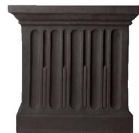
Terra Nera (TN)*