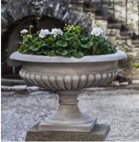
Shown in: Greystone (GS)