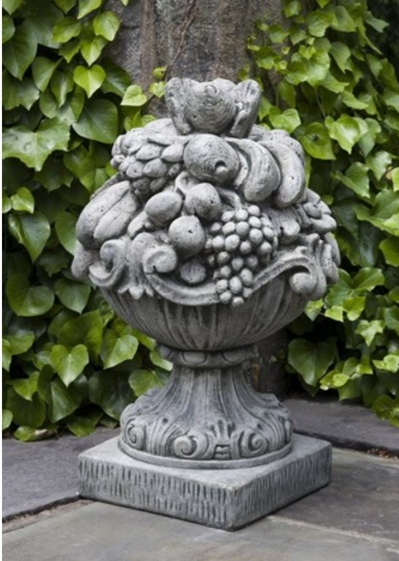
ITALIAN FRUIT BASKET