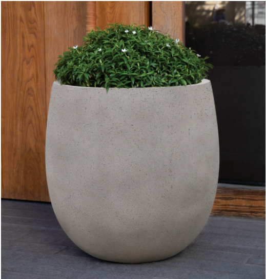
Shown in Stone Grey