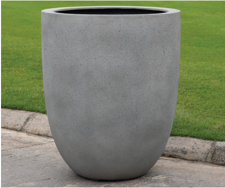
Shown in Stone Grey