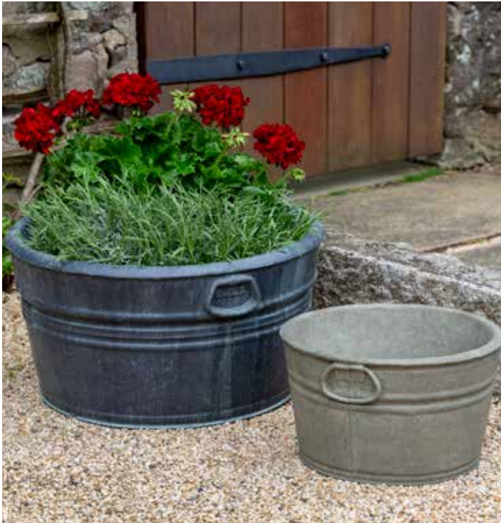
P-796 Large (left) shown in Lead Antique and P-795 Small (right) shown in Greystone