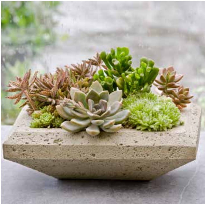
Shown in Verde