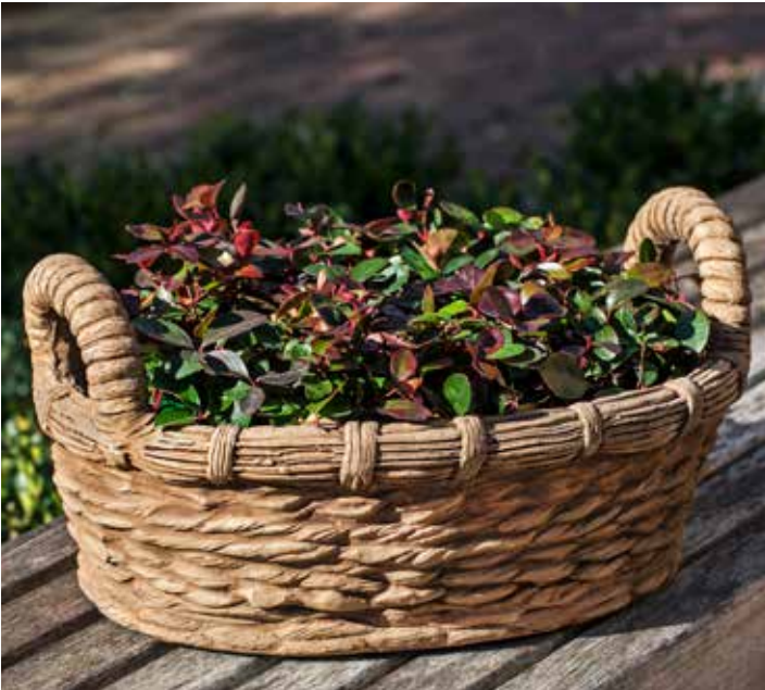
Shown in Brownstone

Available in a choice of thirteen (13) exclusive natural pigment stains in addition to natural. All of our patinas are hand applied in a multi-step process which produces unique and beautiful surface finishes. Designed to replicate the look of naturally aged materials, the patinas will not prevent the natural aging process that occurs in an outdoor environment. Rather than creating uniform stains, our approach gives our products their unique beauty and appeal.