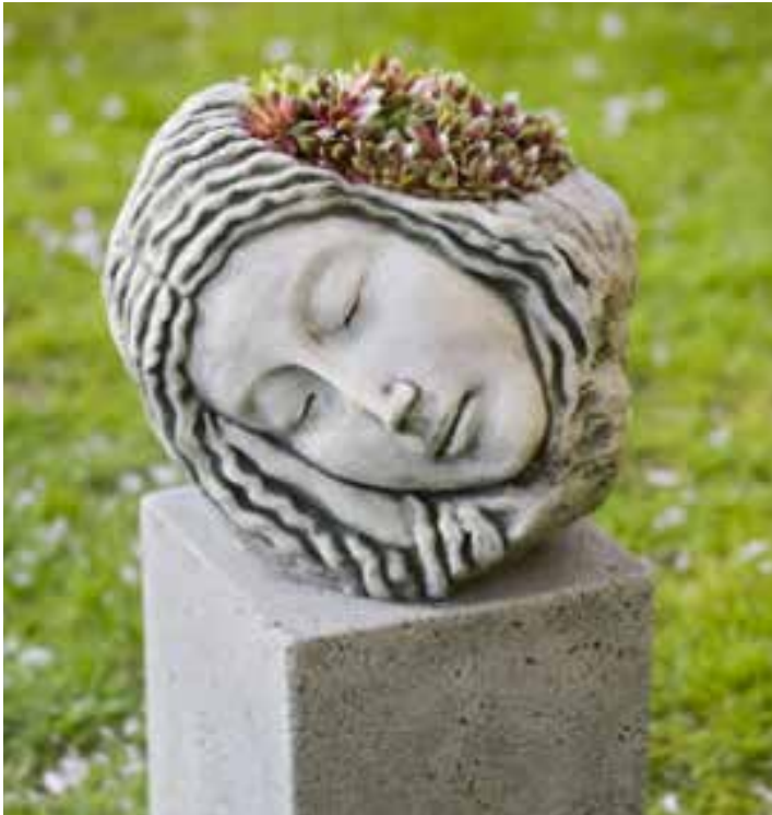
Shown in Alpine Stone