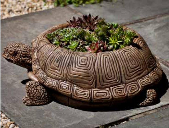
Shown in Brownstone

Campania proudly manufactures its cast stone products in the USA using locally sourced materials. All of our cast stone pieces are manufactured using the wet casting technique with a proprietary high density cast stone mix, yielding a PSI strength of approximately 7,500. The mix is comprised primarily of water, sand, stone aggregate and cement. Our cast stone products may qualify for LEED credits as applicable to your project. Cast stone produces a strong and durable product that will weather naturally in an outdoor environment. Simply stated, cast stone is chosen for its beauty and authenticity. Our material is natural, authentic, made in the USA, and 100% recyclable. These planters are often specified for hospitality projects, large scale public space installations, pedestrian and traffic safety, and other custom projects. Although we recommend that you take advantage of the quick turnaround of our stocked product; these shapes, finishes, and/or sizes are not always right for every job. Campania has the capability to produce custom molds and colors in our Pennsburg, PA factory.