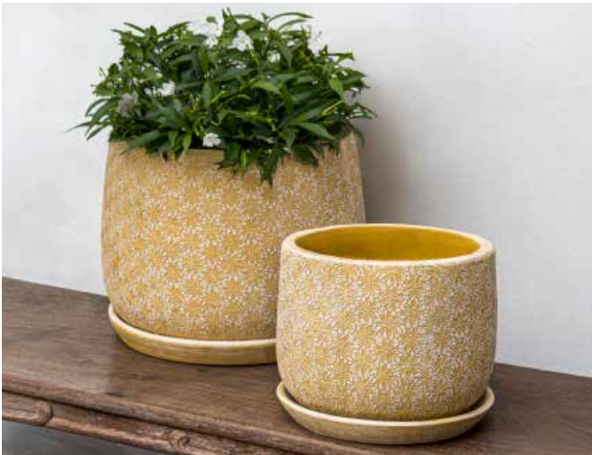
2251-17008 shown in Etched Yellow