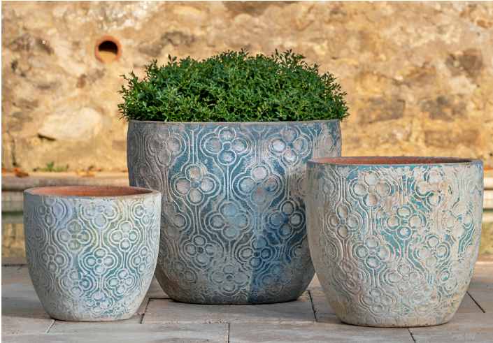
Shown in Vicolo Terra