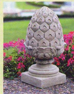
A pineapple finial reproduction lends elegance to any garden. It’s available from Longwood Gardens and Campania International.

Longwood Gardens’ collection of early 20th century garden accents creates ambiance at the famous botanical garden in Kennett Square, Pennsylvania. Now, home gardeners can have some of the same planters, birdbaths and decorative items, thanks to a reproduction collection created from a collaboration with garden container manufacturer