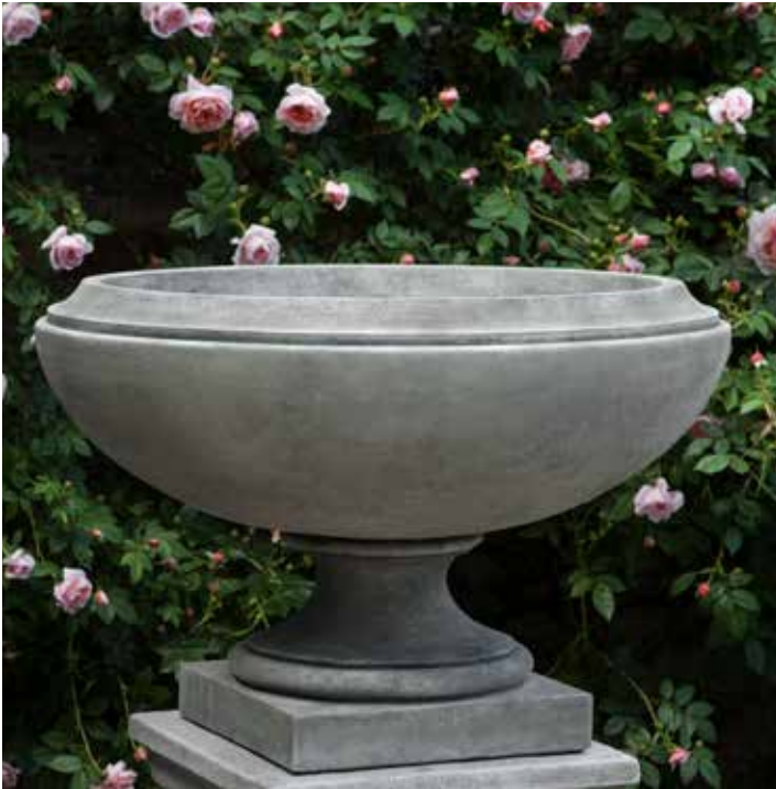
Large Shown in Alpine Stone